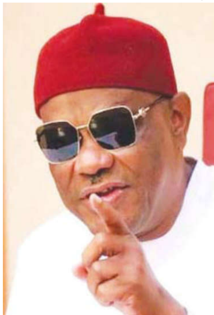
Governor Nyesom Wike

PDP members withdraw from Atiku Abubakar