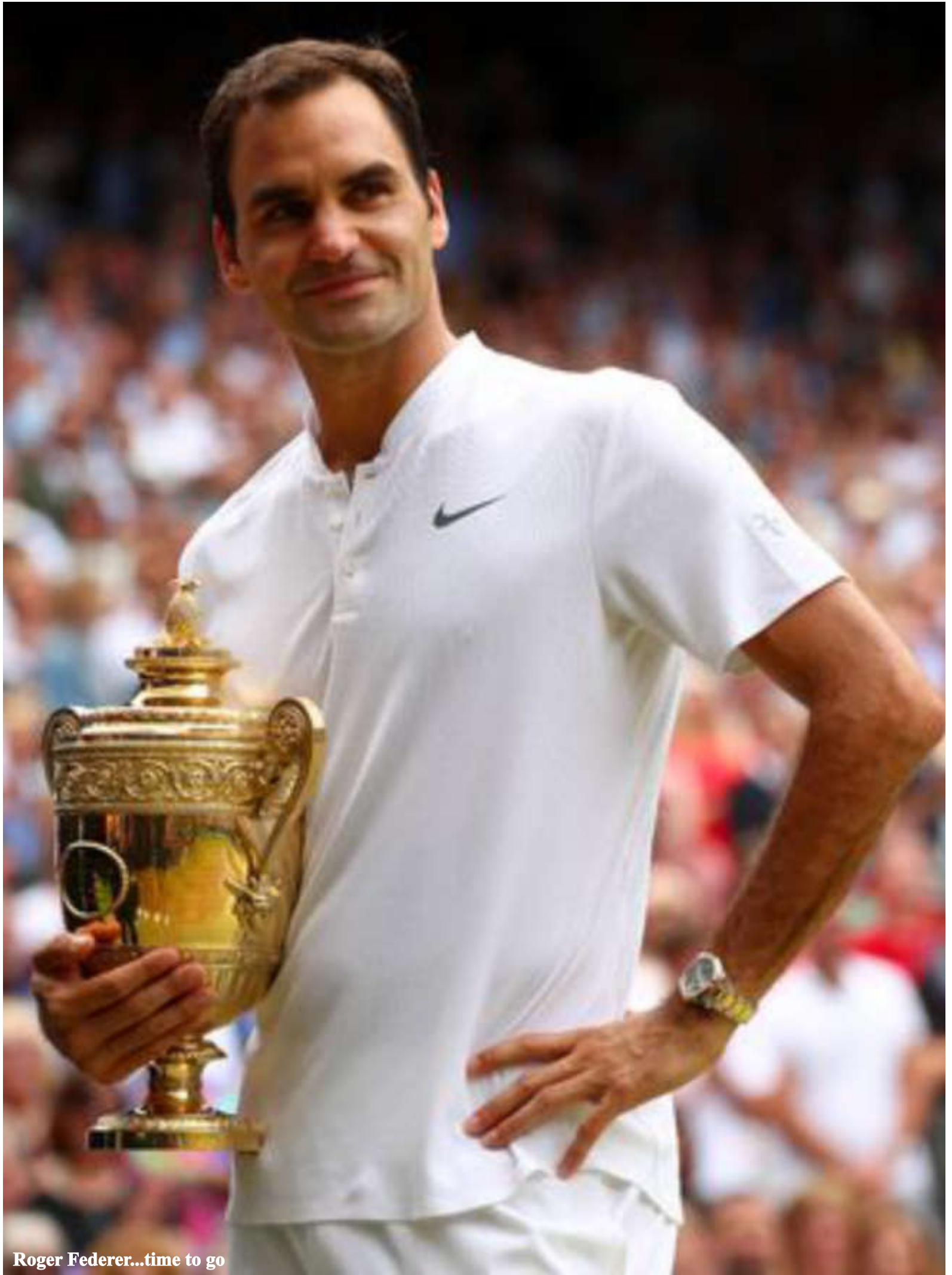
Roger Federer...time to go

"I love seeing people again and that is what I want to let the fans know - you will see me again. In what capacity, I don't know. I still have to think about it a little bit."