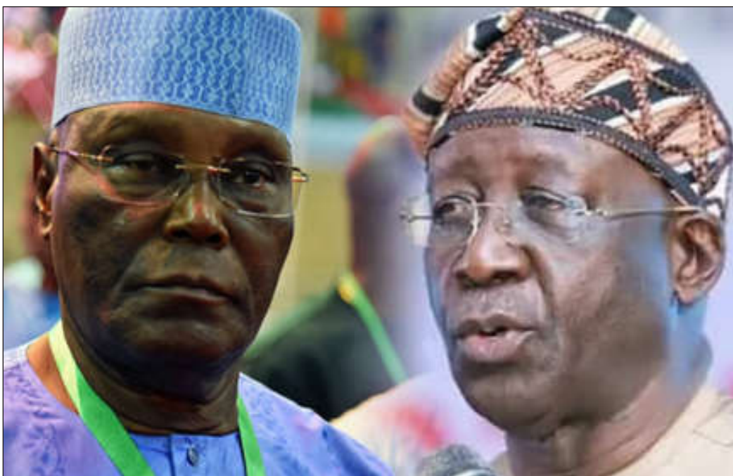
Atiku Abubakar, Iyorchia Ayu

Among those who attended the Port Harcourt meeting were the Rivers State Governor, Nyesom Wike, Oyo State Governor, Seyi Makinde, Benue State Governor, Samuel Ortom, Abia State Governor, Okezie Ikpeazu, Enugu State Governor, Ifeanyi Ugwuanyi, ex-Plateau State Governor, Jonah Jang, ex-Gombe State Governor, Ibrahim Dankwambo, former Ekiti State Governor, Ayo Fayose, former Ondo State Governor, Olusegun Mimiko, former Cross River State Governor, Donald Duke, Chief Bode George, Chief Dan Orbih, and Mohammed Adoke